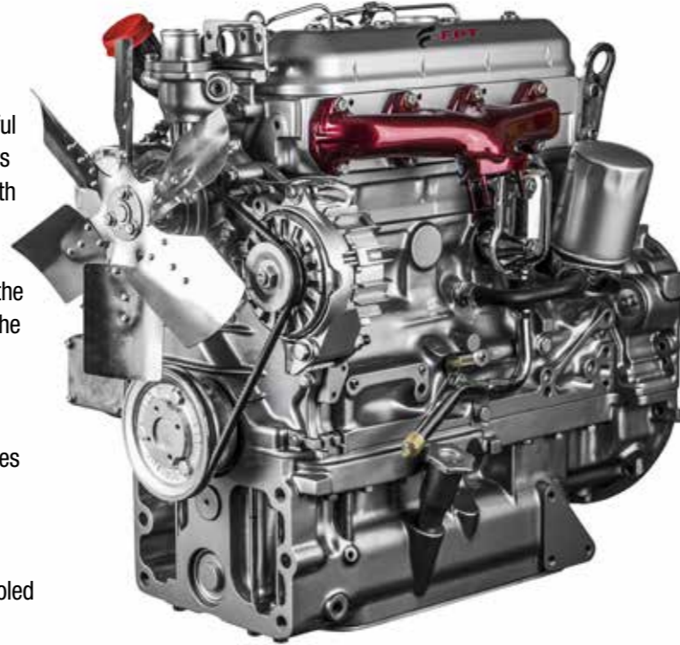
FPT S8000: proven technology!

Coupled with the turbo pre-cleaner, the water cooled engine ensures excellent cooling and high fuel efficiency : -5% compared with the previous model.